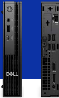
Explore 360 view >