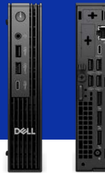
Explore 360 view >